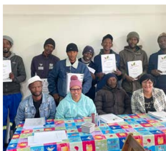
Self development, team leader and discipline labour relationships. Hosted at the Langkloof Training Centre.