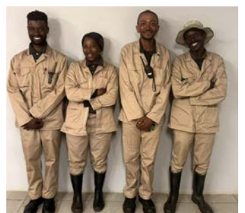
Team leader course presented at Maloney's Eye Farm, Magaliesburg.