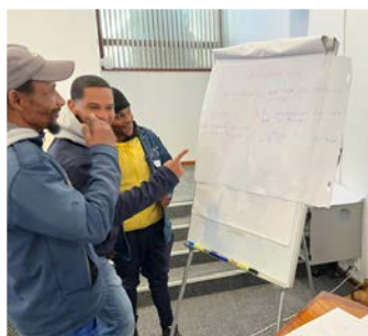
Basic Management Course in Afrikaans, presented in Ceres.