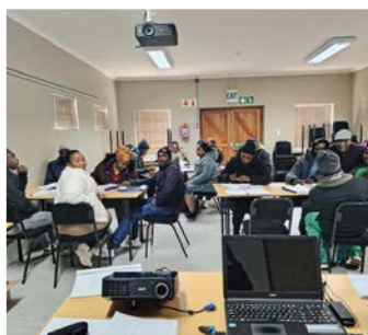
Basic Management Principles Course presented in Xhosa, Ceres.

We captured meaningful moments across multiple training sessions, reflecting the heart of our work: people learning, growing, and stepping into their roles with confidence.