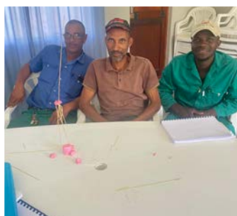
Team building exercises at Elstelm Dairy Farm, on the road to Zuurbraak.