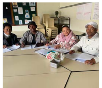
Team leader course presented at KBOS, Ceres in Afrikaans.