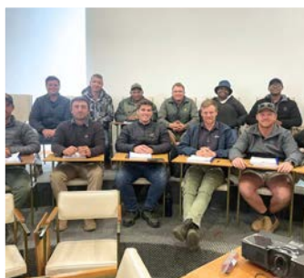
Participation management course for 14 young managers, Ceres.